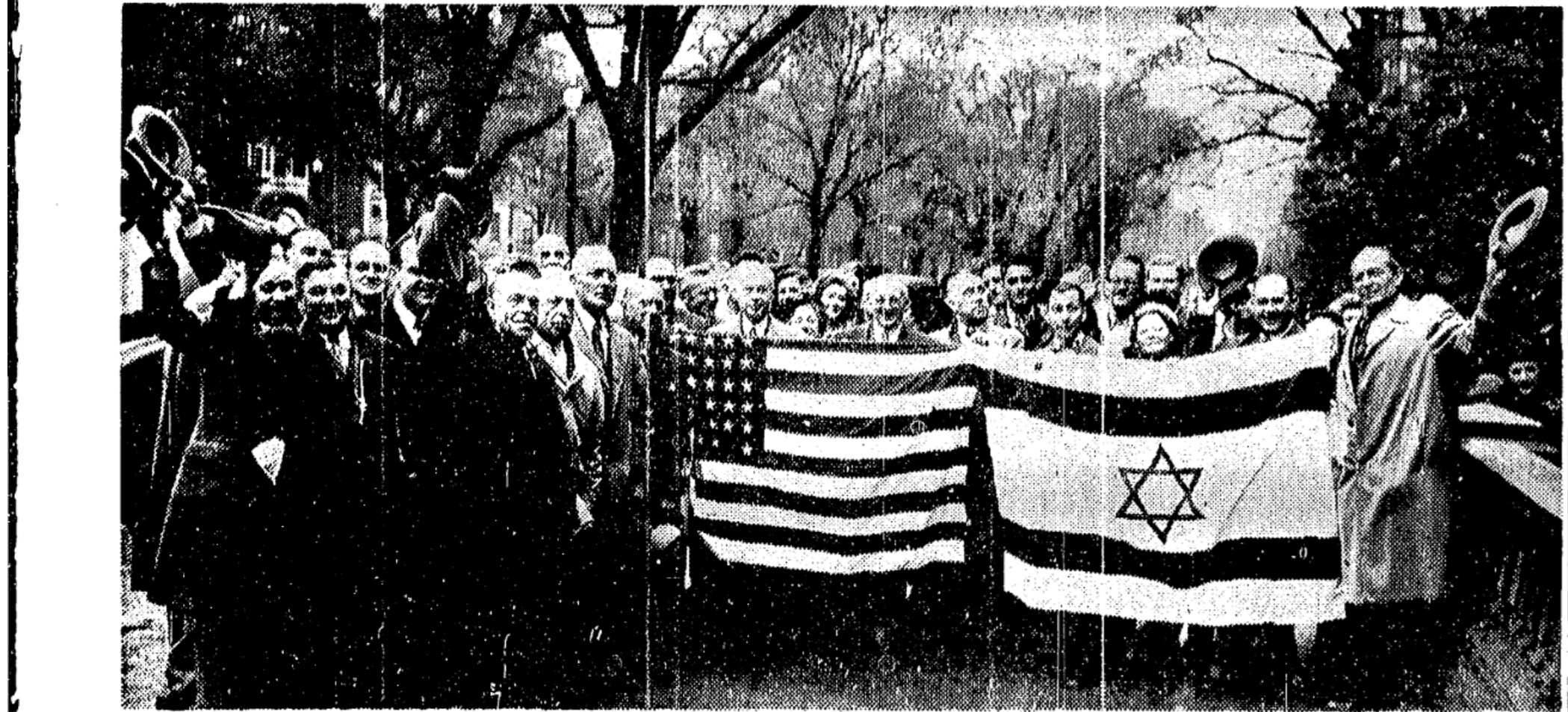
BLUE AND WHITE FLAG OF ZION was raised yesterday at Zionist House, 17 Commonwealth avenue, center of Zionist activities in New England, following news of proclamation of the Jewish State.

BRITANNIA COFFEE SHOP FIELDSTONES by SALLY BOWDEN